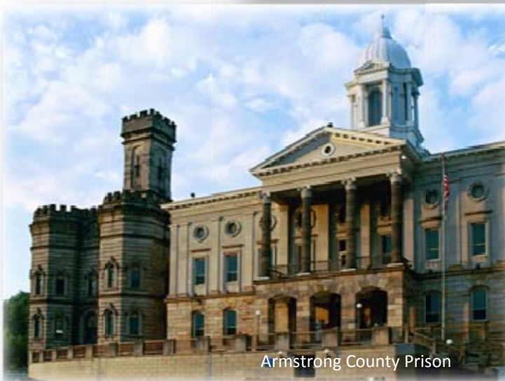
Armstrong County Prison